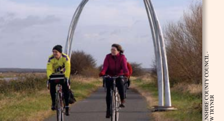
LADY OF SHALLOTT BY ANWICK FORGE