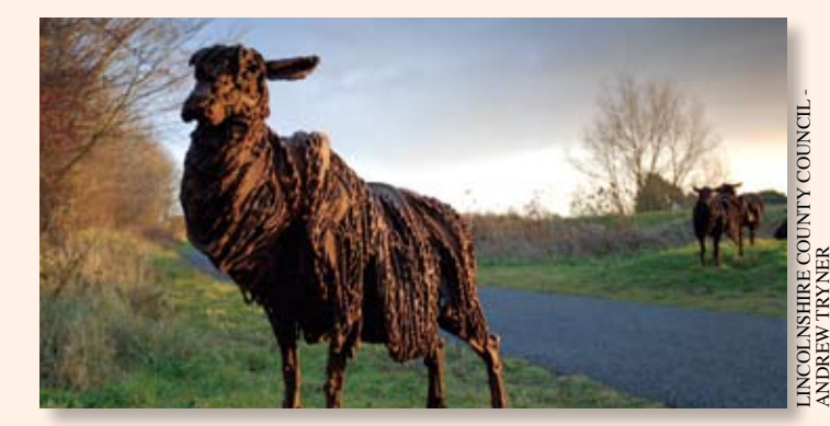
LINCOLN LONGWOOL SHEEP BY SALLY MATTHEWS

This 33 mile route was completed in 2008 and connects Lincoln to Boston. It was named in a local competition and is a pun on its former use as a railway and to celebrate the water rail and other abundant bird life that can be seen from the path.