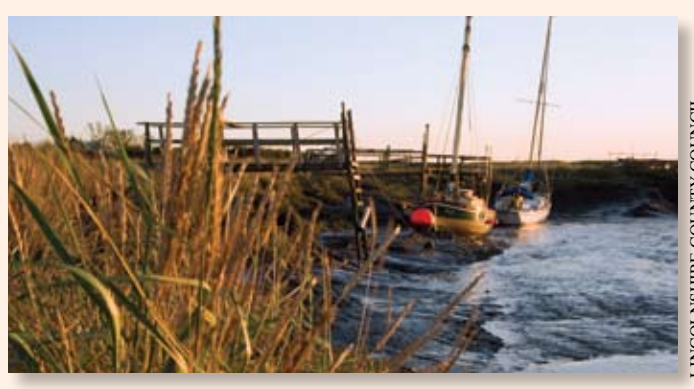
GIBRALTAR POINT WITH ITS BEAUTIFUL SALTMARSHES AND DUNES

These are all sites for cycling to, rather than cycling round and cyclists are asked to leave their cycles at the car parks/entrances and enjoy the reserves on foot.